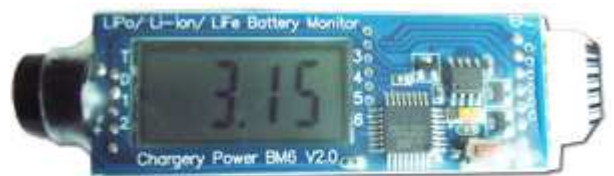
lowest cell voltage setup for alarm