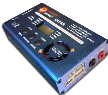
Charging Connection diagram for CHARGERY 0410B