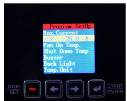
Picture 3 Program setup

value, press the START/ENTER button to the value blink then change the value with the DEC or INC buttons. The new value will be confirmed and saved by pressing the START/ENTER button