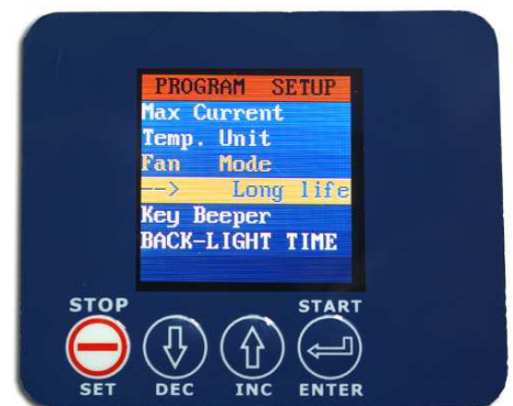
Picture 3 Program setup

If need change the maximal current or other items, please operate according to the following steps.